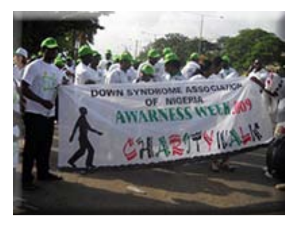
The walk through Lagos

I pinched a few hours sleep on my late night flight from Heathrow and eventually, melting in the heat, I made my way into the arrivals area at Lagos airport wondering how I would find the DSAN representatives that were going to meet me. I need not have worried as it was hard to miss the sea of DSAN printed t-shirts and green baseball caps, that despite being only 5am, had turned out in force to welcome me.