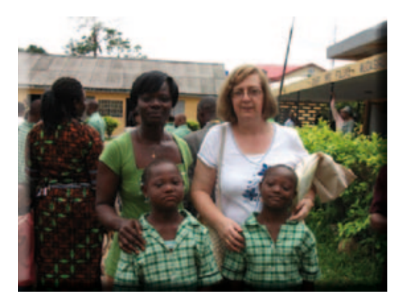
There were lots of photo opportunities!

It was so hot, although I was the only one who seemed bothered by it! Everyone had a great time and there was lots of interest in the walkers from motorists and passers-by. Afterwards we all gathered together for photos and to talk to the press. Everyone was laughing at how hot and red in the face I was.