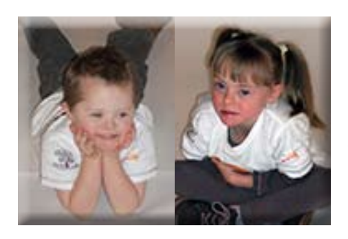
The winning poses

The final was a "Winter Party" and included a fitting for a party outfit to be worn that day, a photograph taken by a professional photographer, a dance workshop with Flawless and a party tea. A panel of judges comprised of Next's Childrenswear Director, Next's Art Director, an Editor from Express Newspapers and the Director of Urban Angels Children's Modelling Agency spent the day mingling with their model guests monitoring progress and compatibility. Gradually they were able to choose just twelve children for new Next advertising campaign. The magical winter party ended with several inches of snow which had fallen whilst everyone was having fun in the huge marquee.