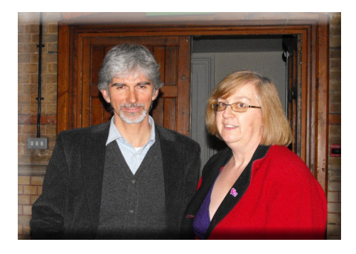
Penny meets Damon Hill at last!