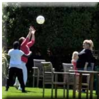
Activity workshop in the sunshine