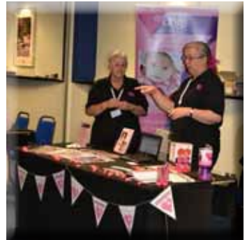
The DHG stall