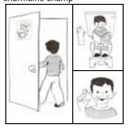
BOBBY CAN USE THE TOILET Including a PULL-OUT SUMMARY CHART